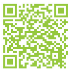
scan code for more details

Join us for Thursday Night Dinner & Sunday Tea